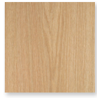
New Age Oak