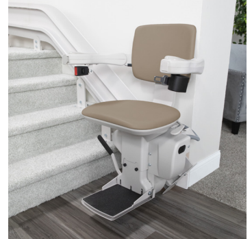
Not all options are shown.