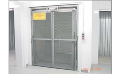
Customer shaft, our expanded metal gates Bi-parting double swing electro-mechaincally interlocked

Double Frame Vertical Reciprocating Conveyors are specifically designed for vertical movement of a large, bulky, heavy material from one elevation to another. Requires minimal floor space and easily installed. The model RJS-2 can be surface mounted or placed in a shallow pit. Our RJS-2 model comes with all the same safety features as the RJS model. The RJS-2 has 2 pistons each with dual ANSI chains.