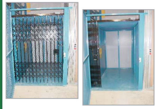
Freight style folding gates

All our cabs can incorporate electrically interlocked gates and doors exceeding the Requirement of ANSI/ASME B20.1